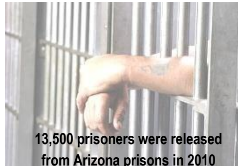
13,500 prisoners were released from Arizona prisons in 2010

Attend our Monday orientations at 11 AM. Orientations are held at the AZCG office. These sessions normally last for one hour. You do not need an appointment to attend.